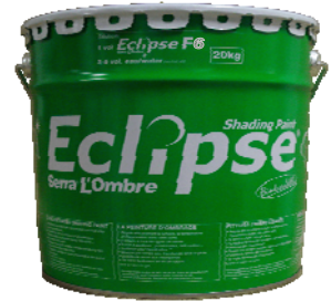
Net Weight 20 Kg

Eclipse® is used to tint glass and plastic greenhouses for a season. It will regulate light intensity and humidity conditions for the perfect climate inside your greenhouse